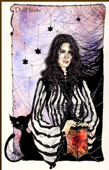
+Margarete+ by =ellaine http://ellaine.deviantart.com