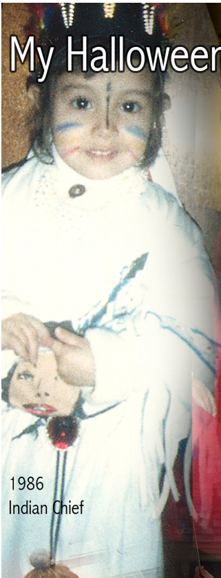
1986 Indian Chief