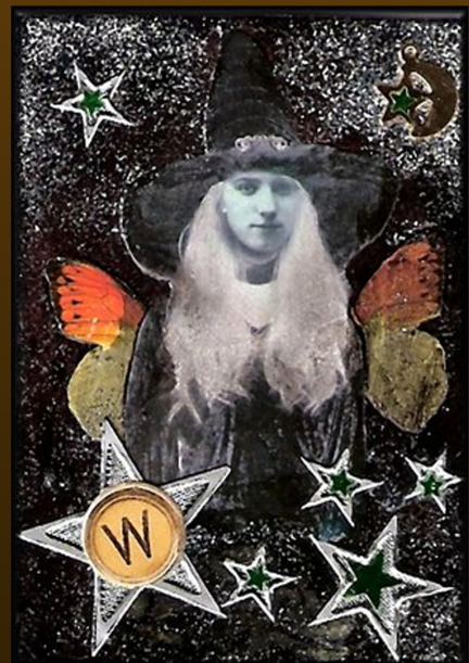
Wicked by *Bohemiart http://bohemiart.deviantart.com