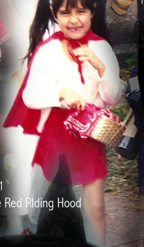
1991 Little Red Riding Hood