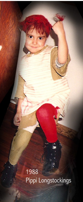
1988 Pippi Longstockings