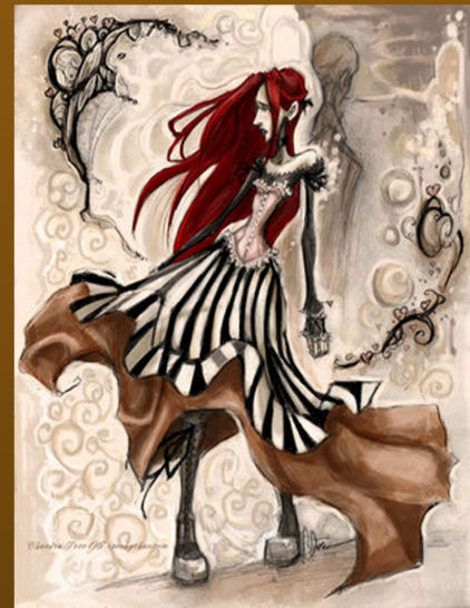
Sorrow in Stripes by =SpookyChan http://spooky chan.deviantart.com