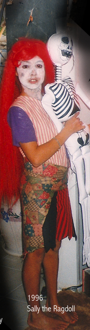
1996 Sally the Ragdoll