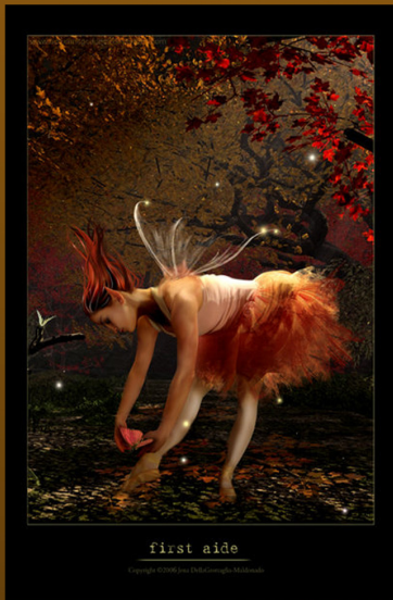
First Aide by *AutumnsGoddess http://autumns goddess.deviantart.com