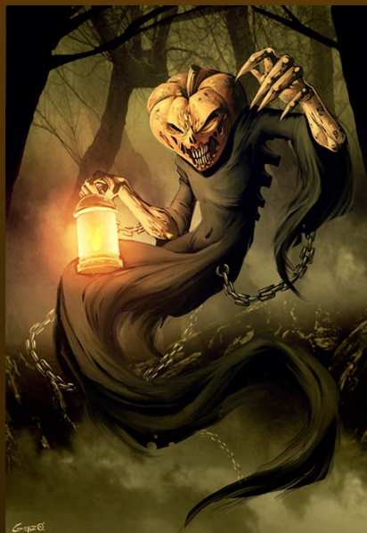
Happy Halloween Jack O Lantern