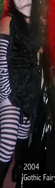
2004 Gothic Fairy