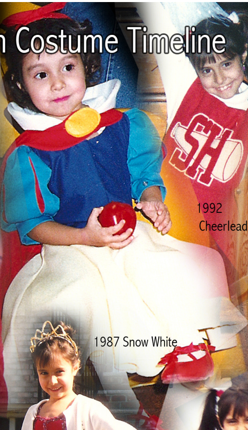
1987 Snow White